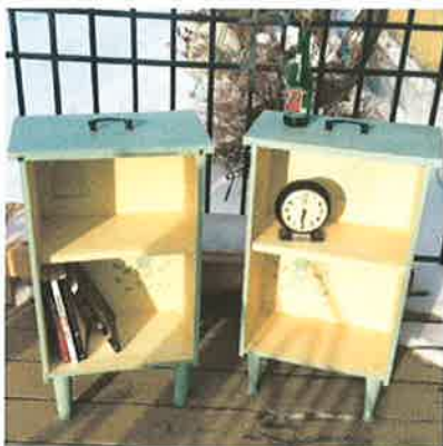
Things for the Home

Please join us by designing and creating upcycled items for the following competition categories: